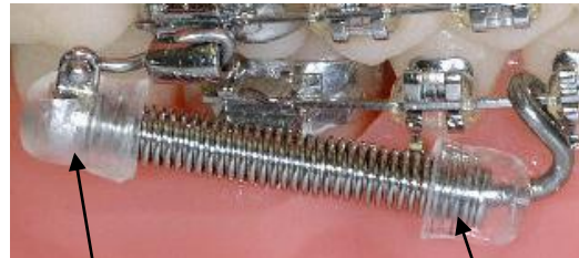
Posterior Spring Cap

2 - 4 mm Caps to be used on 29 mm or larger Rods